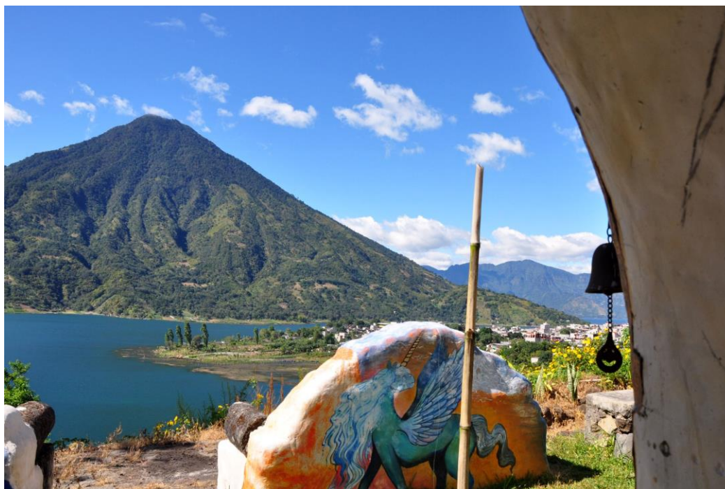
View of Pedro Volcano, Temple of Illumination, Santiago de Atitlan