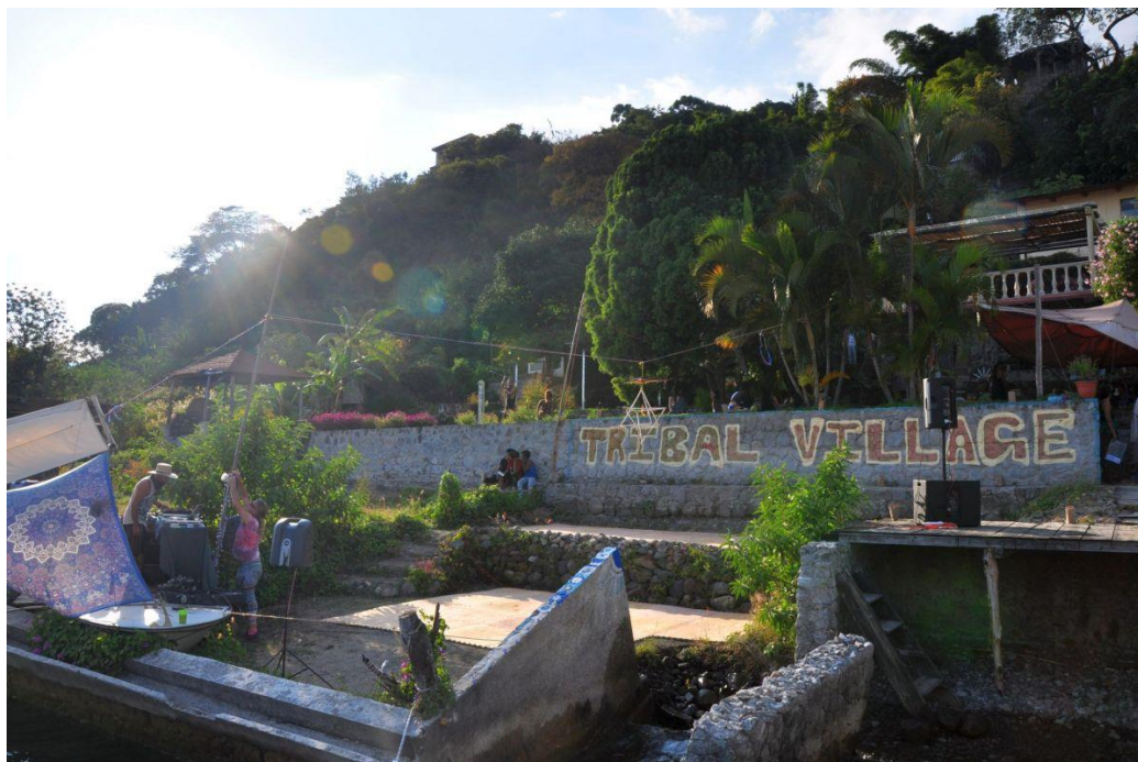
Tribal Village Green Event Productions & Incubators, San Pablo la Laguna