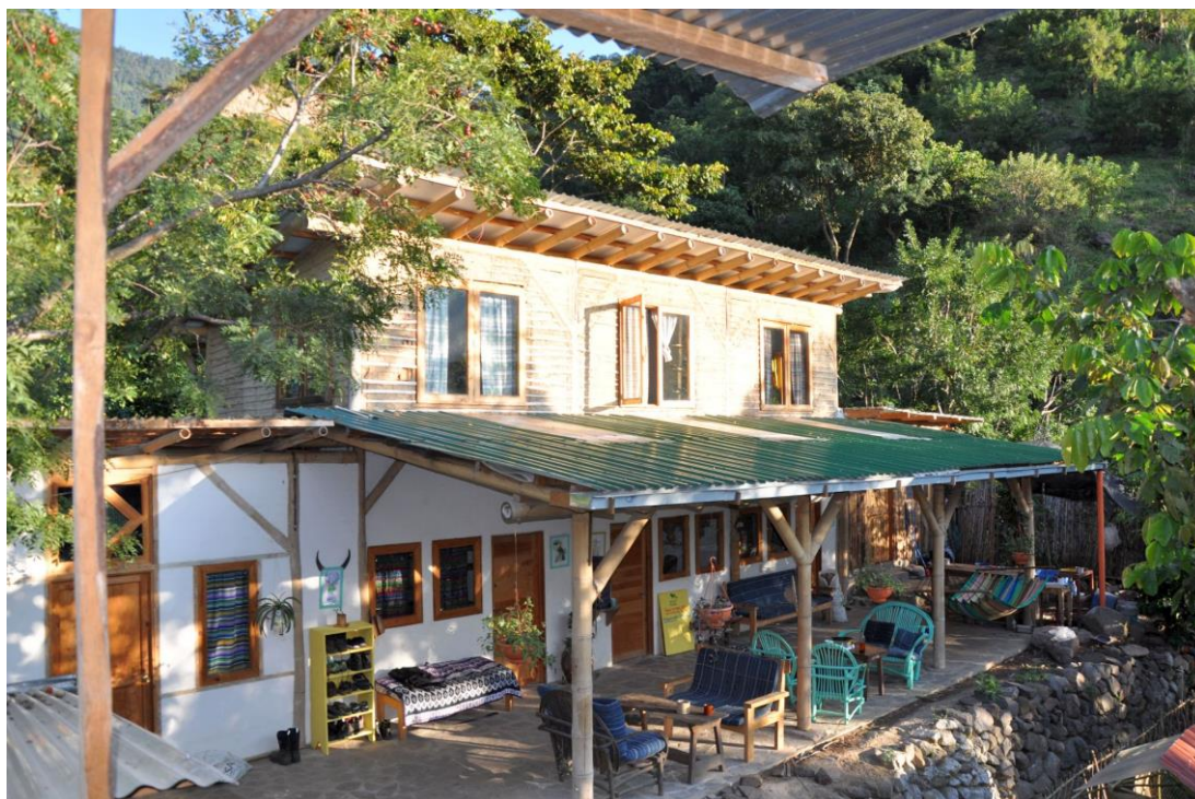
Granja Tz'ikin Permaculture Farm & Green Business Center, Tzununá