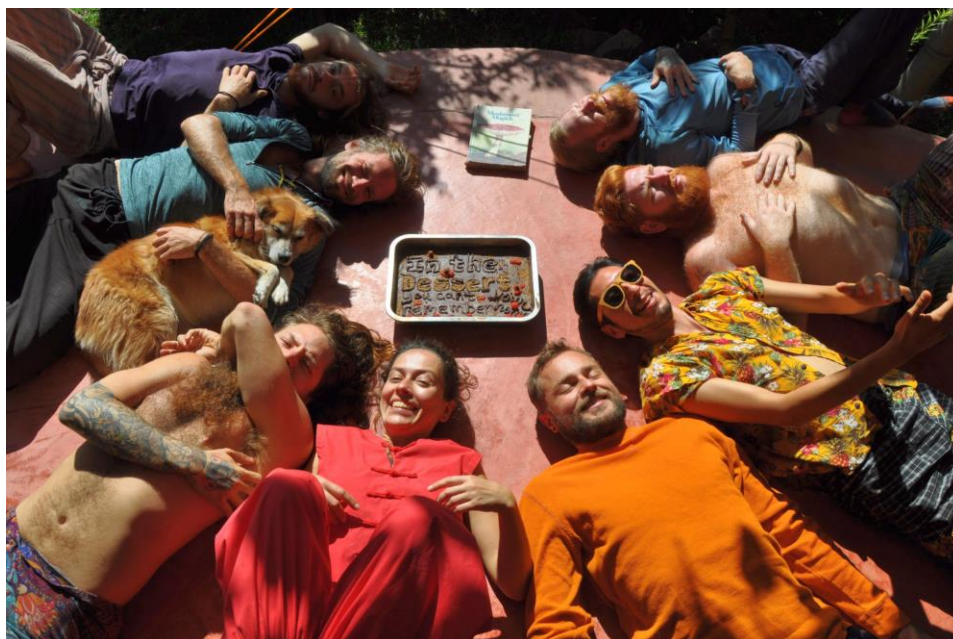
Qi Gong & TCM Retreat Group, Karuna Reading/Writing Sanctuary, Tzununá