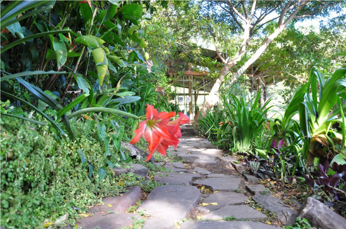
Walking together on a Path to Peace & Enlightenment- Yoga Forest, San Marcos la Laguna