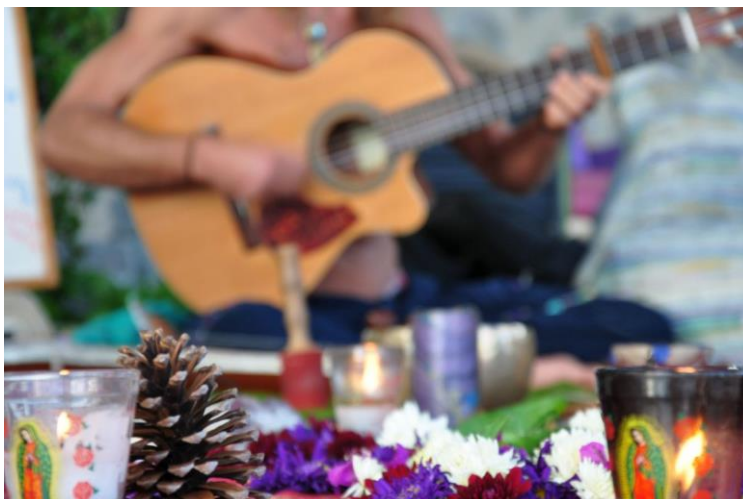
Earth Blessing Ceremony, Eagle's Nest, San Marcus la Laguna