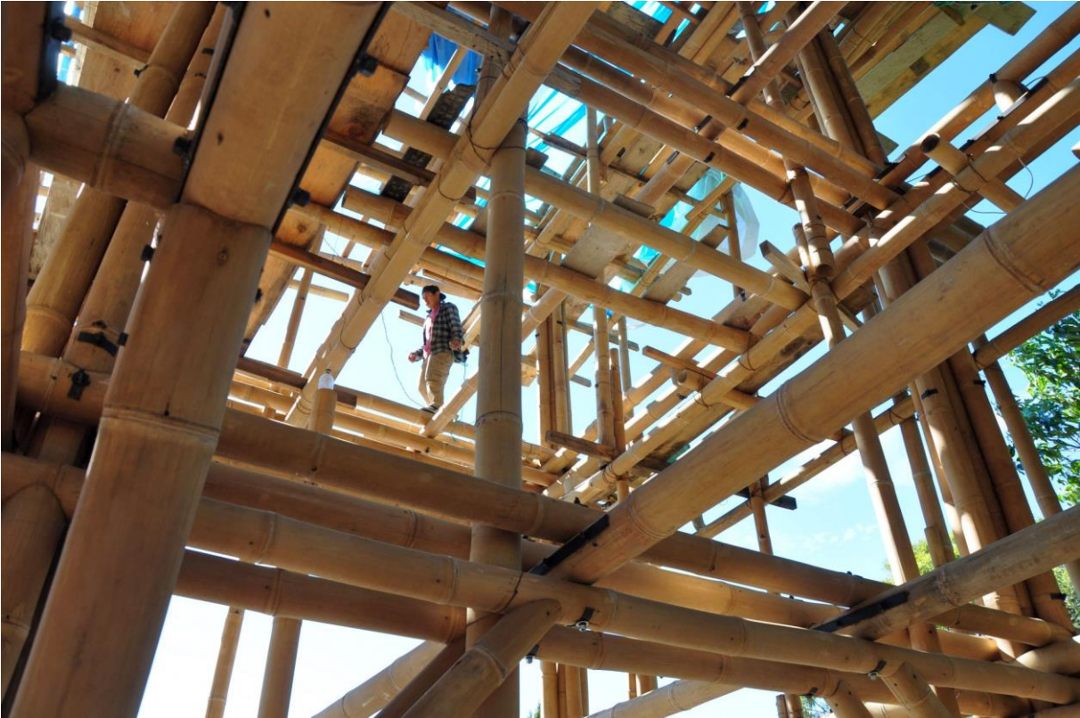
Building the Dream – 4-Story Bamboo Construction, San Marcos la Laguna