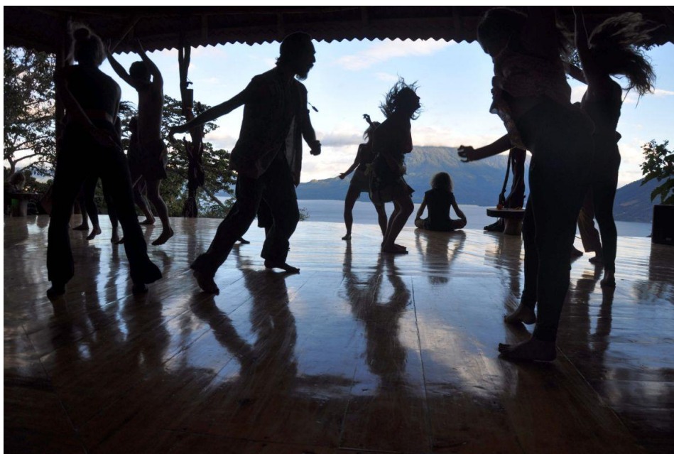
Ecstatic Dance, Arco Isis Heart Alchemy Sanctuary, San Marcus la Laguna

The Alliance hub will offer a well-governed educative foundry / hatchery of impact projects that will gain gravity and soon attract relevant participant numbers and donations. These can then be qualified between the participant organs of the greater body to unfold the greatest multiplier effect. Building the studio on the ground, gaining funds through digital offerings that become more epic and specialized as the campus grows and grows.